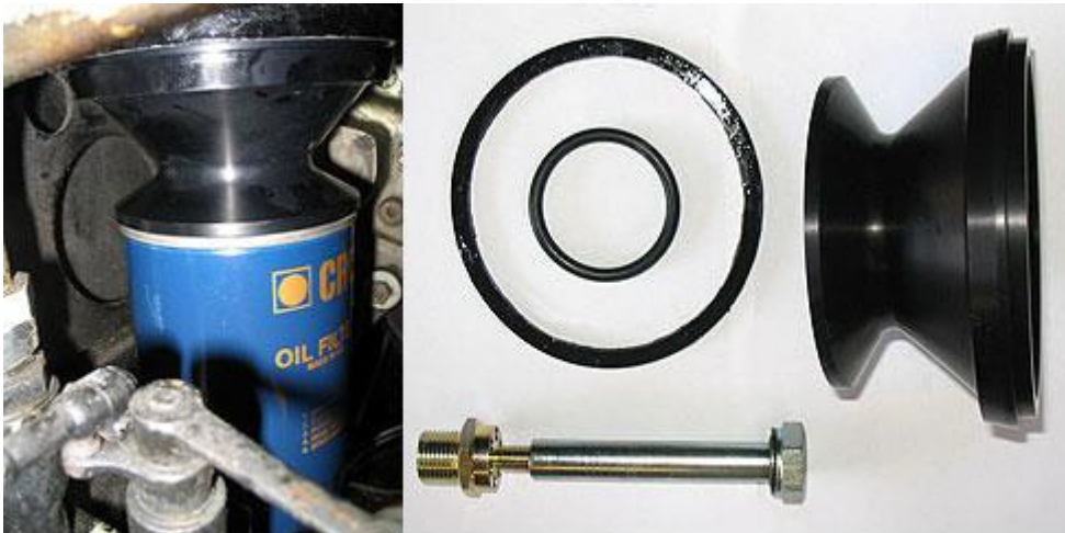
Filter and adaptor kit for R Type of MKVI with single central fixing bolt

Fortunately for us Flexolite of Malvern UK have Spin-off filter converters made for all full flow, post war sixes. These are beautifully made on a CNC machine, extremely easy to fit and relatively inexpensive. As can be seen from the illustration, they comprise of an aluminium spacer about 1 1/2” thick that fastens in the way the original filter did. The new filter fits below. The preferred filter is a Fram PH8A but there are plenty that can be used in an emergency.