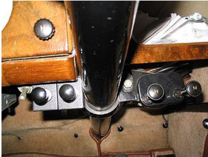
Fig 1. Separate fuel pump switches