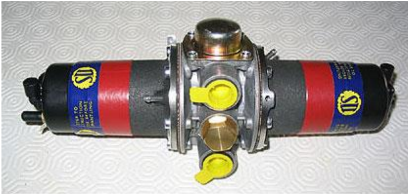
Fig 3. New Pump, in this case an electronic unit

Over the years there has been many variations of the S.U fuel pump model fitted to these cars and in spite of some words to the contrary not all spare parts are available for earlier models. Fig 2 shows one such situation and this pump