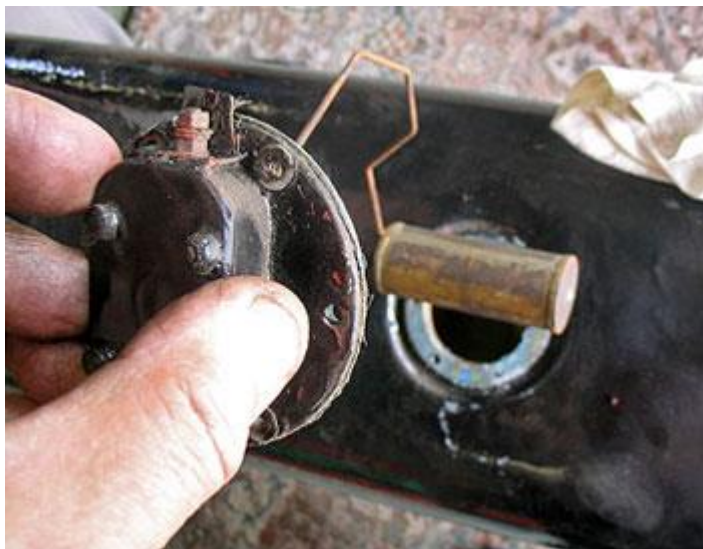
Fig 1. Ready to tilt the float sideways

In this description the term Sender has been used to mean fuel tank unit to which the float is attached and the term Gauge has been used to illustrate the dashboard fuel gauge. This is necessary because R-R used the term gauge to describe both units.