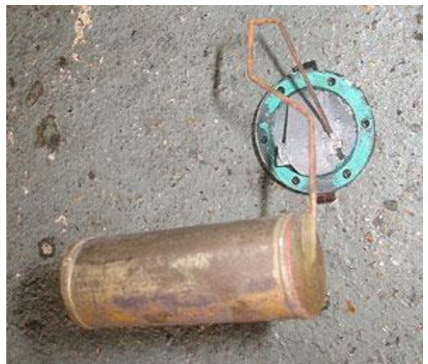
Fig 2. End view of the float arm

The necessary positioning sometimes causes the float arm to be slightly bent out of line and it will then promptly foul the tank baffle during its operation and provide a false fuel level reading. Of