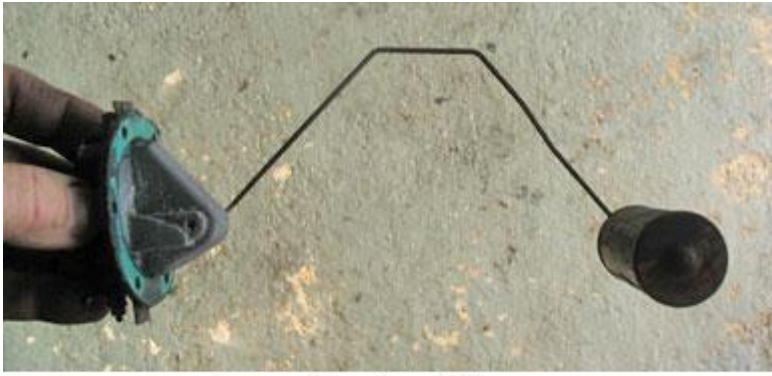
Fig 3. Side view of float arm

Please humour all the contributors of this web site by ensuring you blank off the aperture in the fuel tank caused by the absence of the sender unit before switching on any ignition supply! The dangers of fuel vapour meeting a 12 volt electric spark should be obvious, but if you do not know the answer to this equation it equals explosion, and all our contributors are really upset when Bentley and R-R products are unnecessarily damaged, and your helper will not be happy!